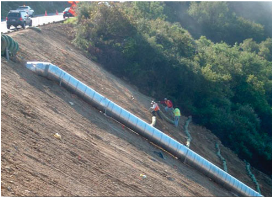
Left: Pipe slope drain on very steep slope.